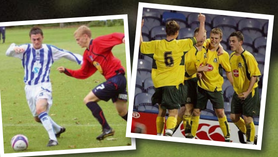
With the season now in full swing the battle has begun for the regional Conference League titles. Last years League and Cup double